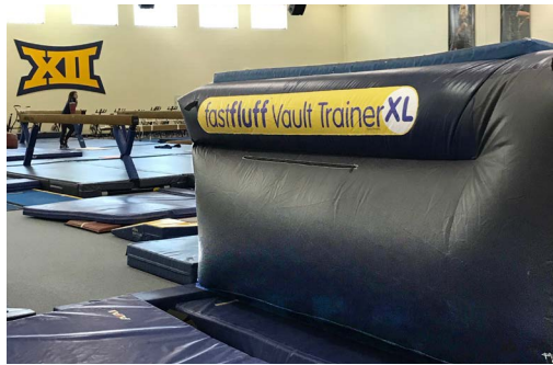
West Virginia University

We understand this and can make your Fast Fluff™ Vault & Floor Trainer, using your colors and logo, in any combination you need.