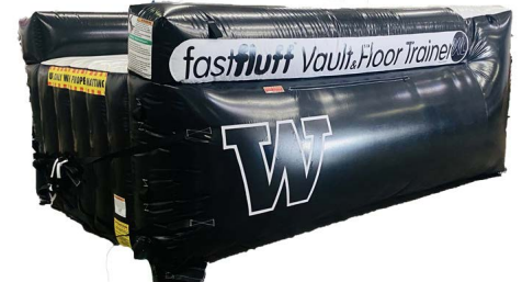
University of Washington