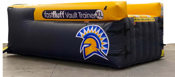
San Jose State University