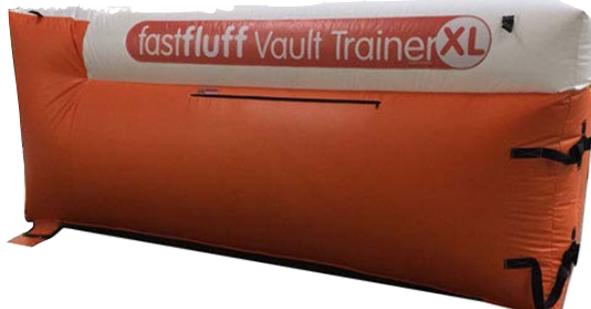
University of Illinois