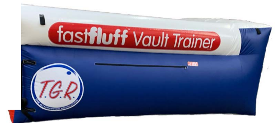
The Gymnastics Revolution